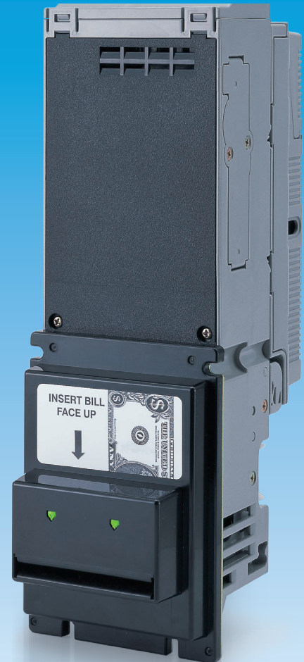
NBM-3000 series Bill Validator